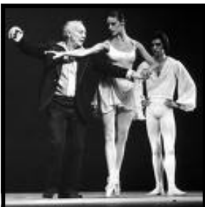
A choreographer, George Balanchine, teaches a dance to a ballerina

Now imagine choreographers (people who create dances) watched dancers for many years, remembering what looked best. They wanted only the moves and poses that showed how beautiful and graceful the human body can be; how smoothly it can move or how suddenly; how excited or how calm those movements can make you feel.