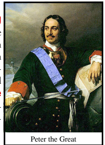
Peter the Great

Pierre Rameau , a French dance instructor, wrote Dancing Master , a book which listed the five basic positions that form the foundation of ballet even today. Dance became easier for women when they began to wear simpler costumes and slippers rather than full dresses and heels. And all professional dancers began appearing without the masks that were traditional since the first masked balls and ballet dinners. Ballet spread to Russia when Peter the Great returned to St. Petersburg from a trip to Europe and established the Imperial Ballet School, and the first American ballet company debuted in Charleston, SC in 1791.