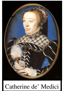
Catherine de' Medici

The first recognizable ballet was presented in 1581 in the court of the important Medici (MEH-dih-chee) family in Italy, but the style had also spread to France, where the first important book on ballet was published in 1588. It described one of the most important principles of ballet: turn-out, or the way dancers can rotate their legs from the hips so their toes point straight out to each side. Turn-out allows dancers to move gracefully in any direction.