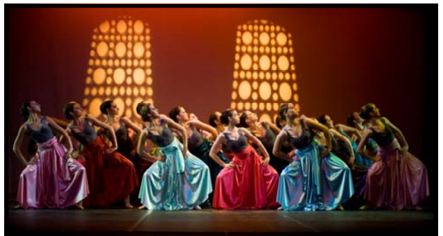
Ballet Pensacola performs in a ballet

That way, when a choreographer sets those movements to music by a composer (a person who writes music) the dancer knows exactly what movements the choreographer is looking for, how they fit the music, and how to make every movement — large or small, fast or slow, excited or calm — as perfect as it can be.