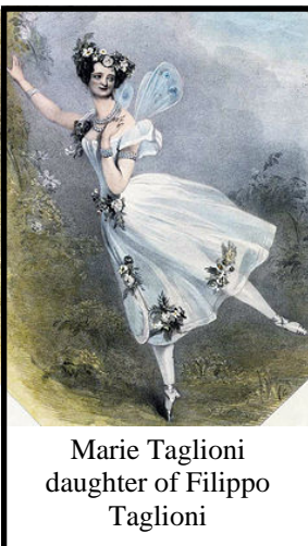
Marie Taglioni daughter of Filippo Taglioni

In 1832, Filippo Taglioni's La Sylphide was the first "romantic" ballet, in which the mood and story are as important as the dancing. Russia began to replace France as the world's ballet capital. War and revolution were causing the decline of European royalty and its aristocratic entertainments, like ballet; and ballet disappeared completely from America. Many important dancers moved to Russia because ballet was