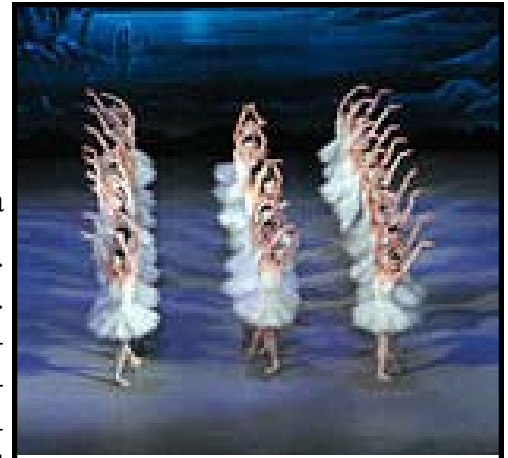
Dancers perform choreography from "Swan Lake"

Y ou know what dance is: moving your body, usually in a way that goes with music. You've seen people dance. Maybe you dance, too, making up the movements as you go. Sometimes, when a group performs on stage and everybody's moving together, their moves were planned in advance. That planning is called choreography (koh-ree-AH-grah-fee), from two Greek words meaning "dance" and "writing." So, "choreography" means "writing out a dance."